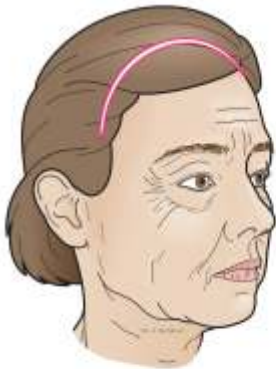
1.1- Coronal brow lift, very large incision