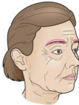
1.2- Direct brow lift, incision is just above eyebrow