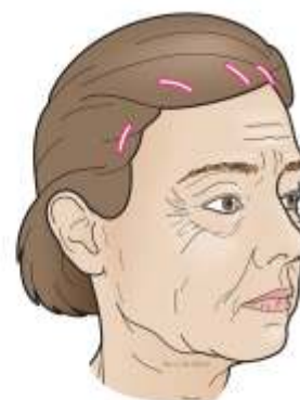
1.3- Endoscopic/ telescopic camera method, with small incisions hidden in hair line